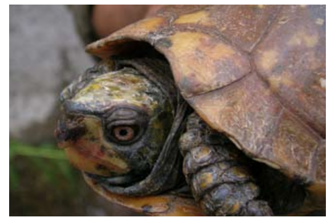
Figure 3. Old adult male Terrapene nelsoni klauberi , Rio Aros, Sonora.