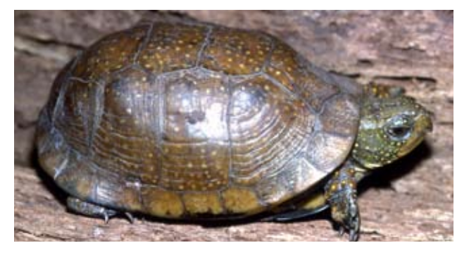
Figure 8. Adult Terrapene nelsoni nelsoni from Nayarit.