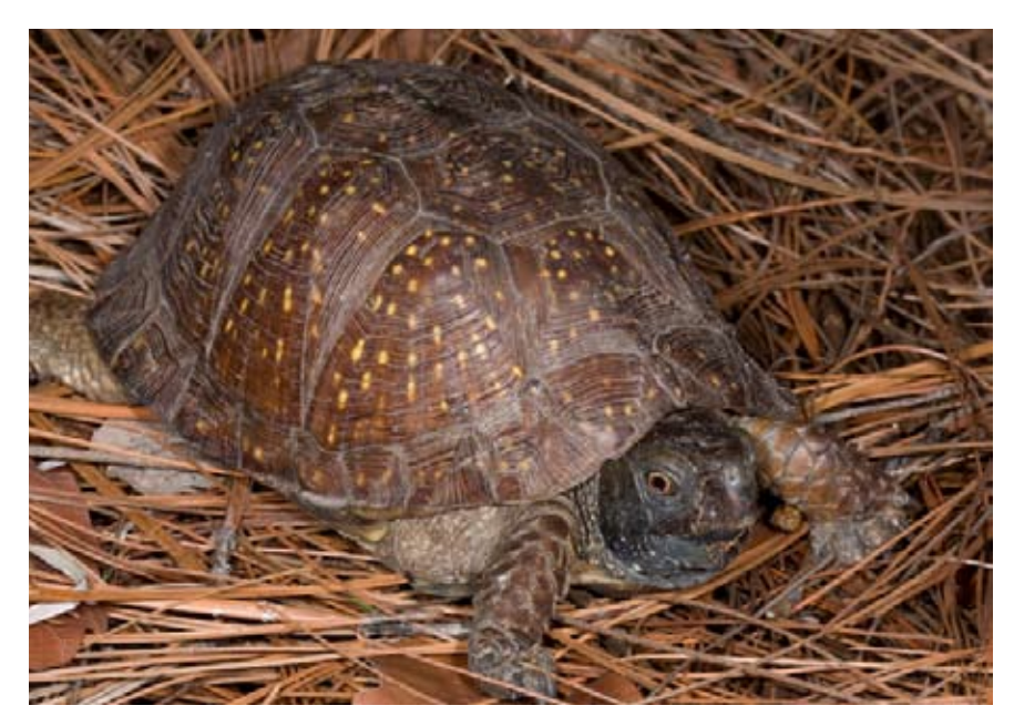
Figure 1. Adult male Terrapene nelsoni klauberi, near Yecora, Sonora.

"Sierra de Nayarit, partie occidentale" by Léon Diguet a year or two earlier (Mocquard 1899). It was not mentioned in the literature again until Smith and Smith (1979). This specimen, originally bearing the label Cistudo carolina, had been misplaced until 2001 (figured in Devaux and Buskirk 2001). Significantly, this heavily spotted specimen appears to have been a female whereas the unpatterned holotype (miscaptioned Fig. 36 of Ditmars 1934, better illustrated by Milstead 1969) is a male (Shaw 1952). Had Diguet's female specimen from Nayarit been declared the holotype of a new species, or been available for comparison to Stejneger's (1925) holotype, the nomenclatural history of Terrapene nelsoni surely would have evolved differently. Sexual dimorphism within Terrapene nelsoni is much more impressive than reported distinctions between the regional subspecies (Buskirk 2002).