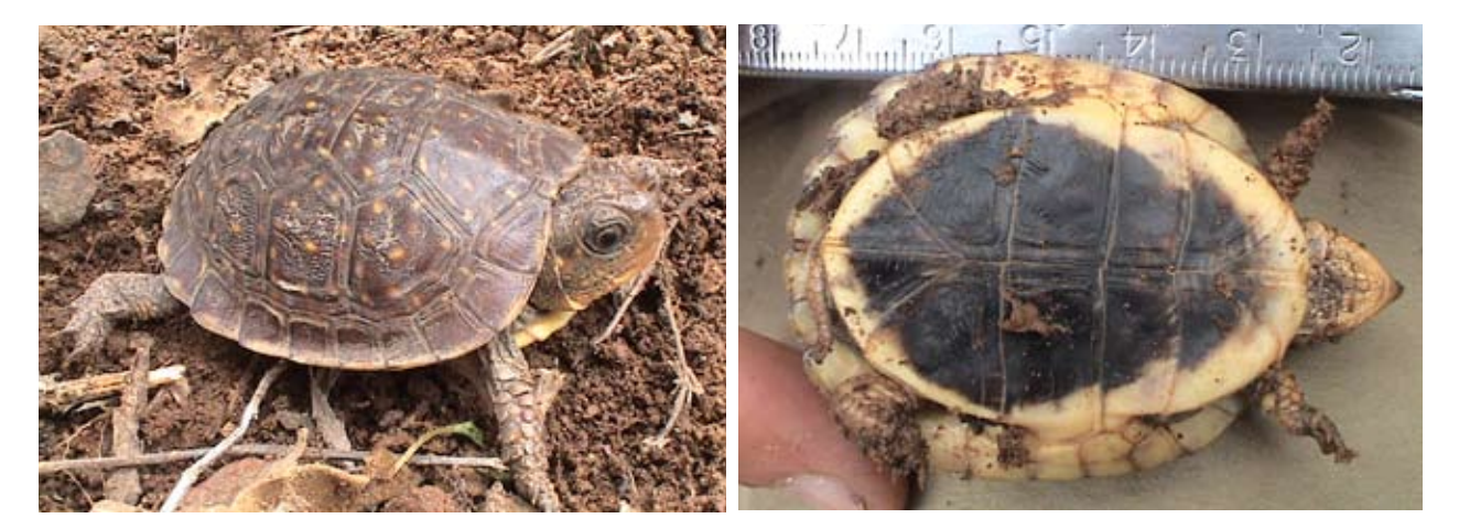
Figure 5. Post-hatchling Terrapene nelsoni klauberi, Palo Amarillo, Uruachi, Chihuahua.

Description . — Mature specimens of T. nelsoni fall within the dimensional range of adults of the more familiar T. carolina , excepting subspecies T. c. major . Milstead (1969) provided 134 mm as the average straight line carapace length (CL) of southern adults examined, the maximum being 146 mm. Northern specimens ( T. n. klauberi ) averaged 131 mm CL, with the largest measuring 151 mm. The CL of a living male Spotted Box Turtle from southern Sonora measured by