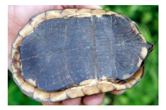
Figure 2. Subadult male Terrapene nelsoni klauberi , west of Yecora, Sonora.

and Tinkle (1967) described an "Ornata Group" and a "Carolina Group" within the genus Terrapene based on 12 morphological traits, and considered ornata and nelsoni to be sister species. Milstead (1969) expanded the criteria to 16 traits. The first workers to examine several (37) nelsoni from the type locality, as well as 13 specimens of klauberi from Sonora and the single Sinaloan specimen (a carapace and plastron only), Milstead and Tinkle (1967) further speculated on the common ancestry of T. ornata and T. nelsoni-T. klauberi, possibly through the extinct T. ornata longinsulae. That both recent members of the Ornata Group tend to inhabit savanna habitats, rather than forests or wetlands, was cited by them as further evidence of their close relationship. Milstead and Tinkle found little but plastral scute ratios and the contour of the first vertebral scute to distinguish between the southern and northern races of the Spotted Box Turtle, and limited their discussion of sexual dimorphism to the degree of flaring of the posterior marginals (more marked in the larger southern sample) and the tendency for females to be