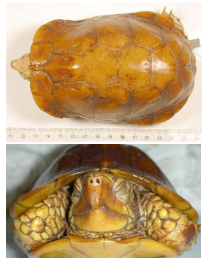
Figure 6. Preserved adult male Terrapene nelsoni nelsoni , the holotype (USNM 46252) from Pedro Pablo, Nayarit.

the first author was 159 mm (Buskirk 2002). Some degree of dorsal flattening is present, and there may be a central keel or remnants thereof on vertebrals 2 through 4, as well as faint lateral keels. The outline of the carapace may be elongate, oval, or roundish. To a varying extent, the posterior marginals may be flared in males, particularly among southern turtles (Milstead 1969, Dodd 2001).