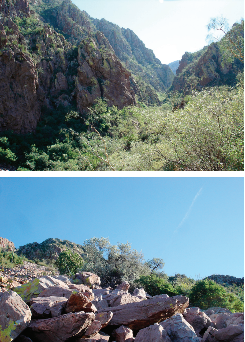
FIG. 3. Sierra Kunkaak. (A, top) Sheltered, interior canyon, ca 0.5 km up canyon from Siimen Hax waterhole. (B, bottom) Sideroxylon leucophyllum on talus slope on north side of Cerro San Miguel. Photos by Benjamin Wilder, 25 Nov 2006.