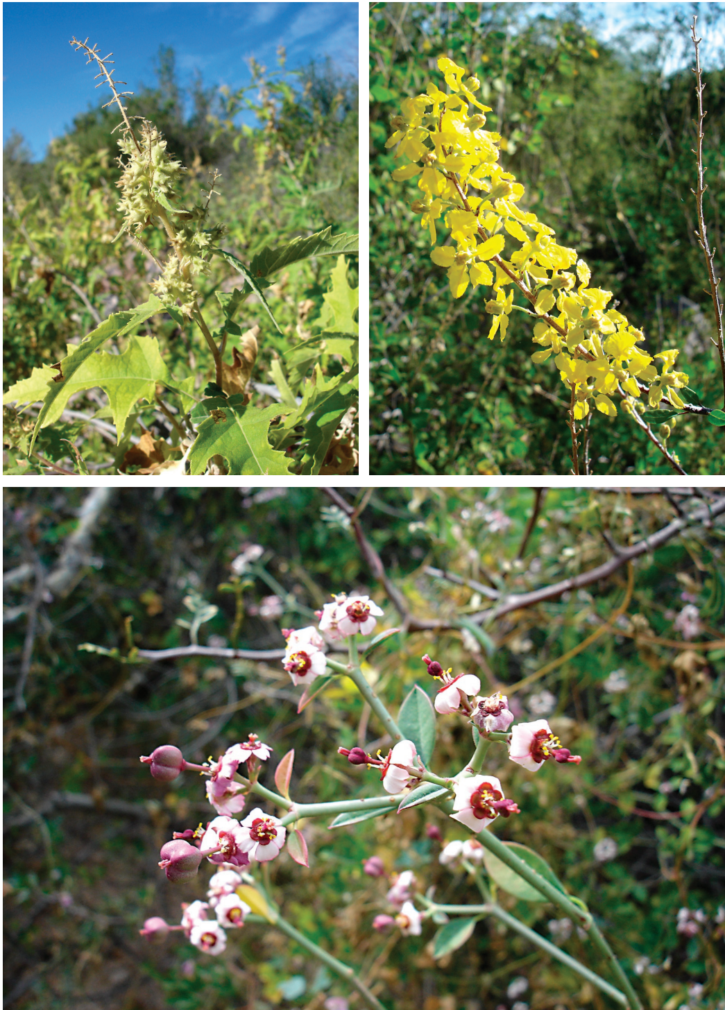
FIG. 4. New records from Sierra Kunkaak. (A, top left) Ambrosia carduacea (Wilder 06-383). (B, bottom) Euphorbia xanti (Wilder 06-453). (C, top right) Echinopterys eglandulosa (Wilder 06-377).