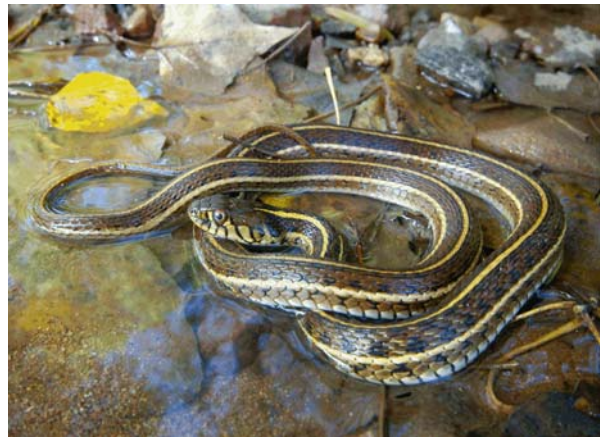
Mexican gartersnake ( Thamnophis eques ), Rancho Los Fresnos NW of Cananea. This species has declined in northern Sonora.