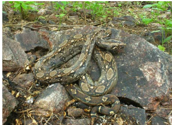
Boa constrictor ( Boa constrictor ) in tropical deciduous forest near Alamos.