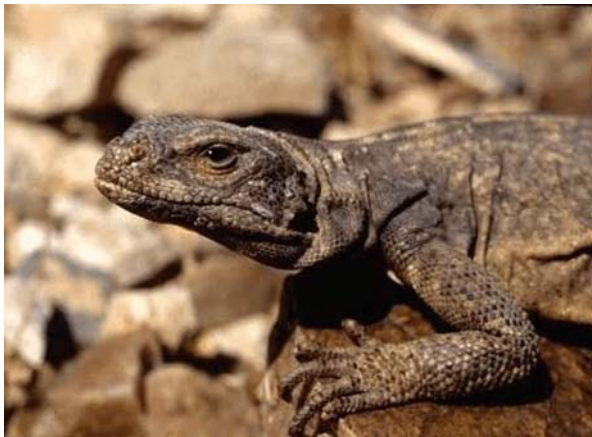
Chuckwalla ( Sauromalus ater ) at its northwestern-most locality in Sonora - El Capitan ~45 km east-southeast of San Luis Río Colorado