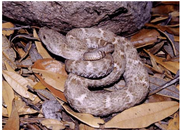
Ridge-nosed rattlesnake ( Crotalus willard ), Sierra San Luis