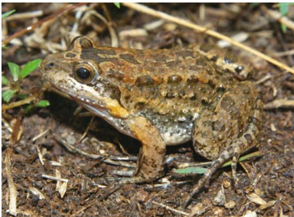
Sabinal frog ( Leptodactylus melanonotus ), Sierra de Alamos