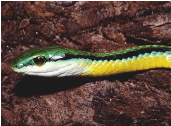
Pacific Coast parrot snake ( Leptophis diplotropis ), west of Alamos