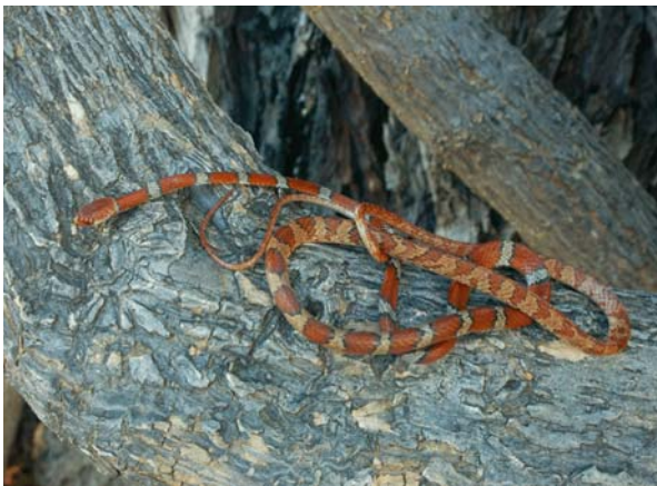
Central American tree snake ( Imantodes gemmistratus ) from west of Alamos.