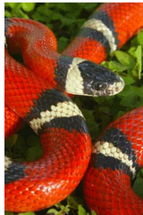
Sinaloan milksnake ( Lampropeltis triangulum ) near Alamos