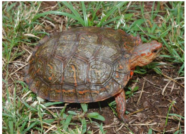
Juvenile Painted wood turtle ( Rhinoclemmys pulcherrima ), Minas Nuevas