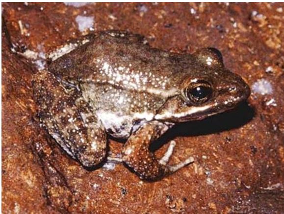
Cascade frog ( Rana pustulosa ), Arroyo el Cobre near Choquincahui