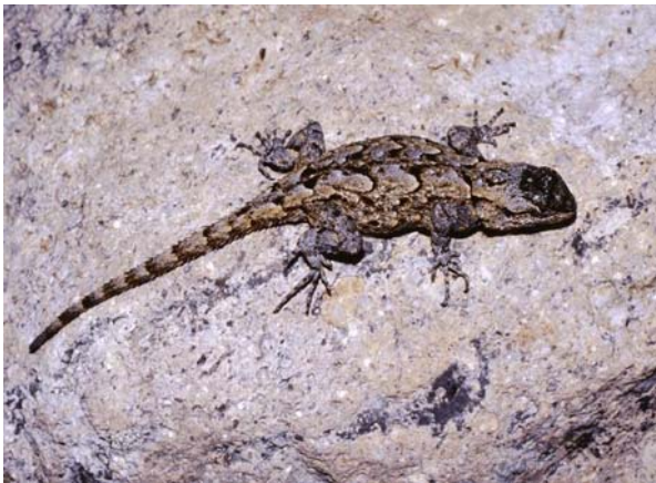
Chihuahuan mezquite lizard ( Sceloporus lemosespinali ), Sierra San Luis