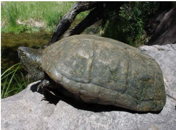
Sonora mud turtle ( Kinosternon sonoriense ), Rancho Los Fresnos. This is the most widely distributed of Sonora's four mud turtles.