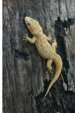
Yellowbelly gecko ( Phyllodactylus tuberculatus ), Rancho Acosta, Alamos