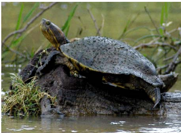
Yaqui slider ( Trachemys yaquia ), Río Mayo