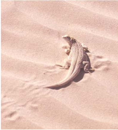
Yuman Desert fringe-toed lizard ( Uma rufopunctata ), Gran Desierto

Appendix A. Photographs of representative Sonoran amphibians and reptiles. All photos by the author, except Geophis dugesii , taken by Ian Recchio.