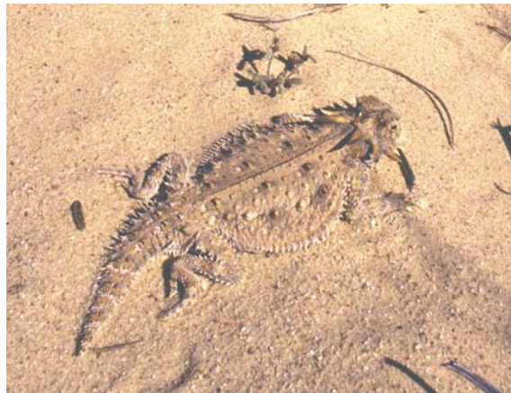
Flat-tailed horned lizard ( Phrynosoma mcallii ), Gran Desierto near Bahía Adair