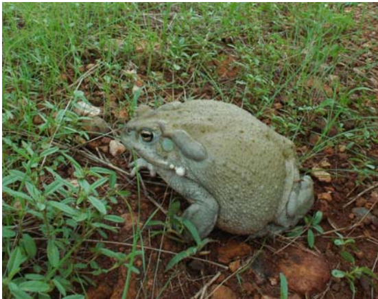
Sonoran Desert toad ( Bufo alvarius ) in thornscrub