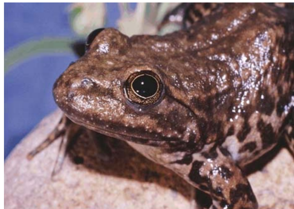
Tarahumara frog ( Rana tarahumarae ) from the Sierra de la Madera