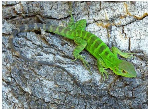
Juvenile spiny-tailed iguana ( Ctenosaura macrolopha ) (green), Río Cuchajaqui. Adults are gray to gray-brown and can be 0.5 m total length.