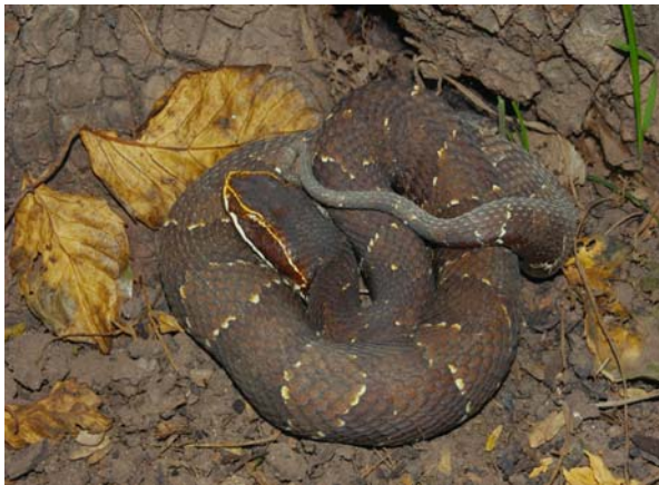
Cantil ( Agkistrodon bilineatus ) from west of Alamos