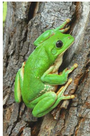
Mexican leaf frog ( Pachymedusa dacnicolor ), Río Cuchajaqui