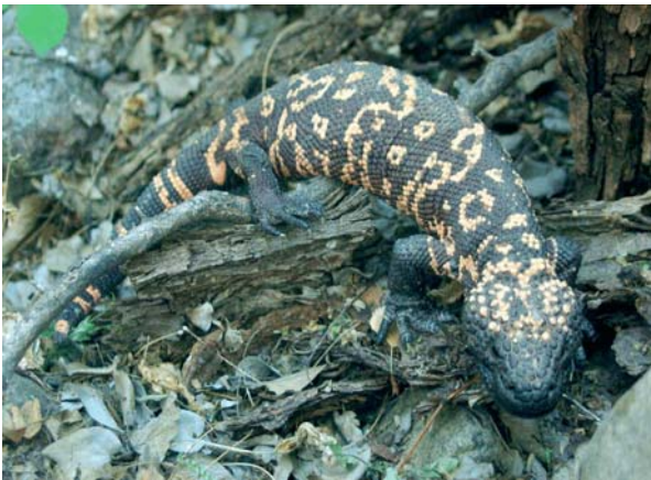
Gila monster ( Heloderma suspectum ), Rancho el Aribabi, northeast of Imuris