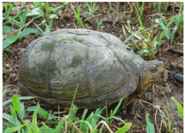
Alamos mud turtle ( Kinosternon alamosae ), El Caracol west of Alamos. This species and K. arizonense lack distinctive head stripes or reticulations.