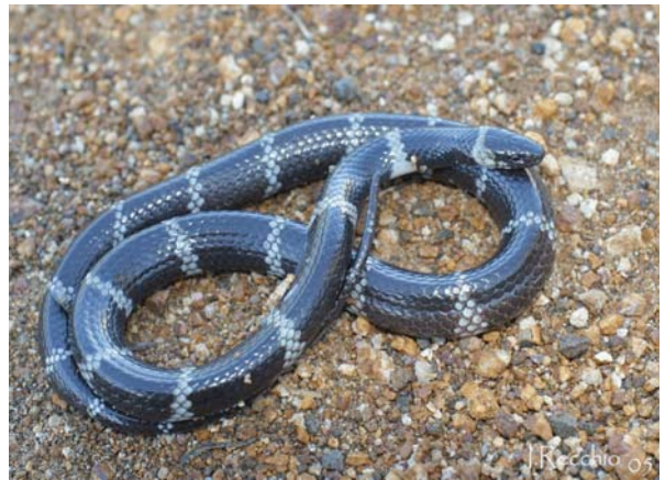
One of four specimens of Dugés's earth snake ( Geophis dugesii ) known from Sonora.